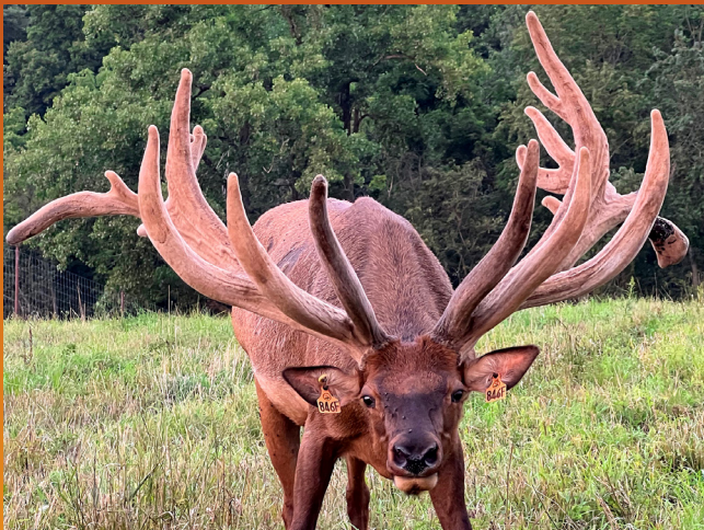
QHR "Leverage" LL Genotype*